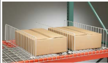
Kwik Klip Dividers