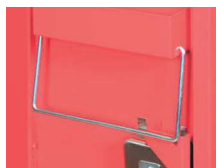
Comb & Brush Tray with Towel Bar