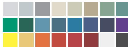
Chart of 24 Brilliant Colors See Page 70